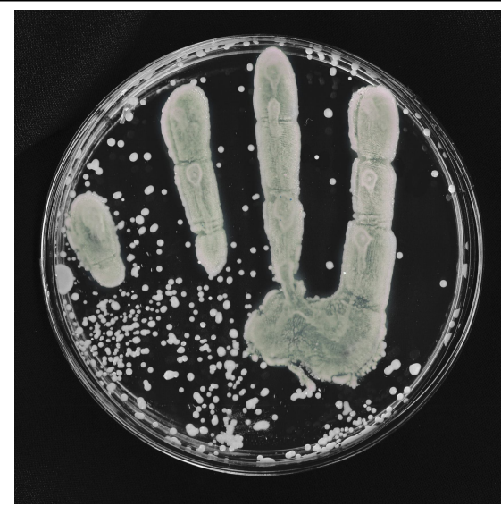
Before applying Epi-San

All personnel whose hands may come into contact with food products should be encouraged to use Epi-San prior to entering food processing areas.